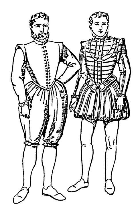
Venetians & Slops

KR/JrN/N: Trunk hose, Venetians, pansied slops (with or without canions).